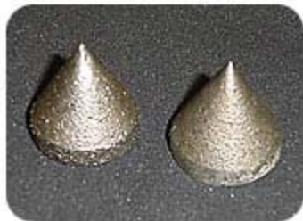
Loose Type 102 Tips

Tips shown fitted to a feed roll (or pineapple roller).