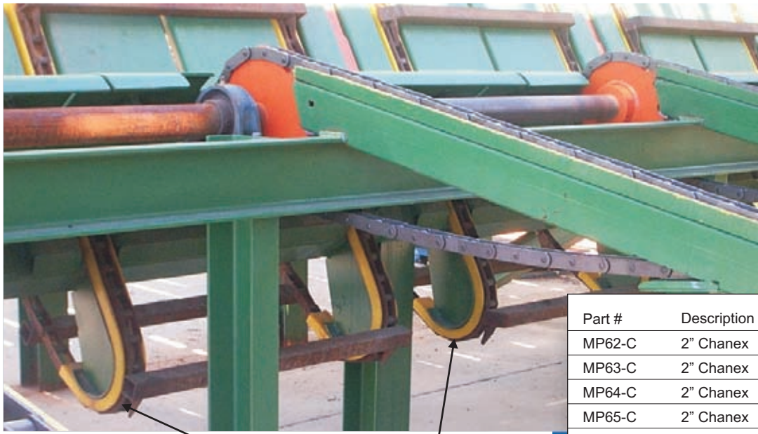
Northex Oregon Bend